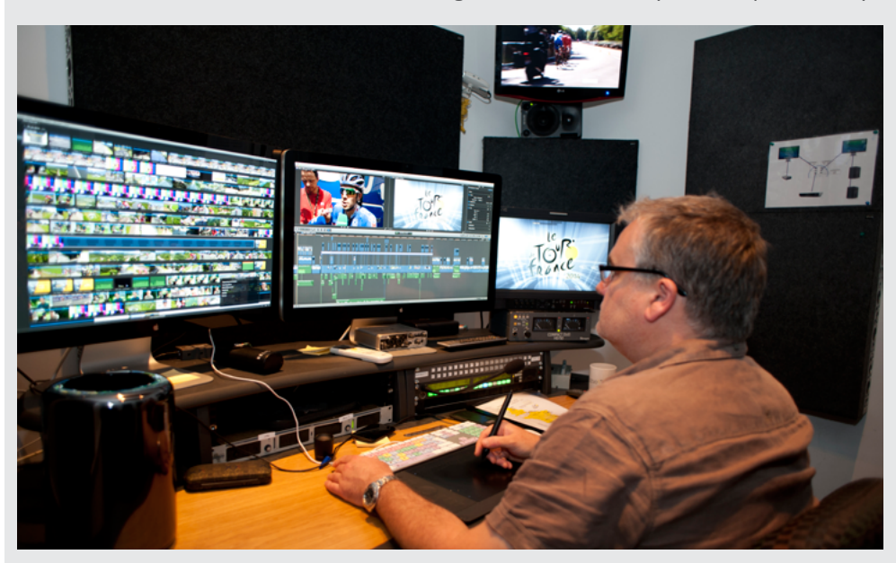
A look at the edit suite for Vsquared TV's broadcasts of the Tour de France

working on a sporting event this summer with the help of several leading companies in the industry, including PROMISE Technology, a leading developer of storage solutions for creative professionals and sports entertainment. The incredible array of equipment deployed by Vsquared TV for their four main edit suites includes the PROMISE SANLink2 and Pegasus2, the new Mac Pro, AJA IO 4Ks, Softron Movie Recorder, in addition to several iMacs and a silver Mac Pro. It's an incredible set of gear which absolutely blew Vsquared away!